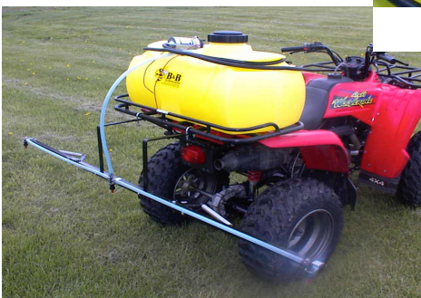
BOOM MOUNT ATV