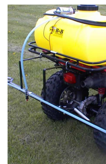
BOOM MOUNT ATV